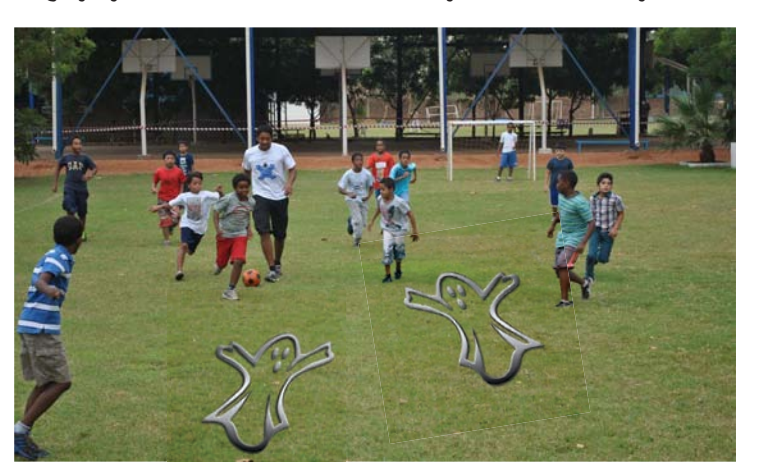
After School Activities Session 2

Enjoy your weekend and see you on Sunday!